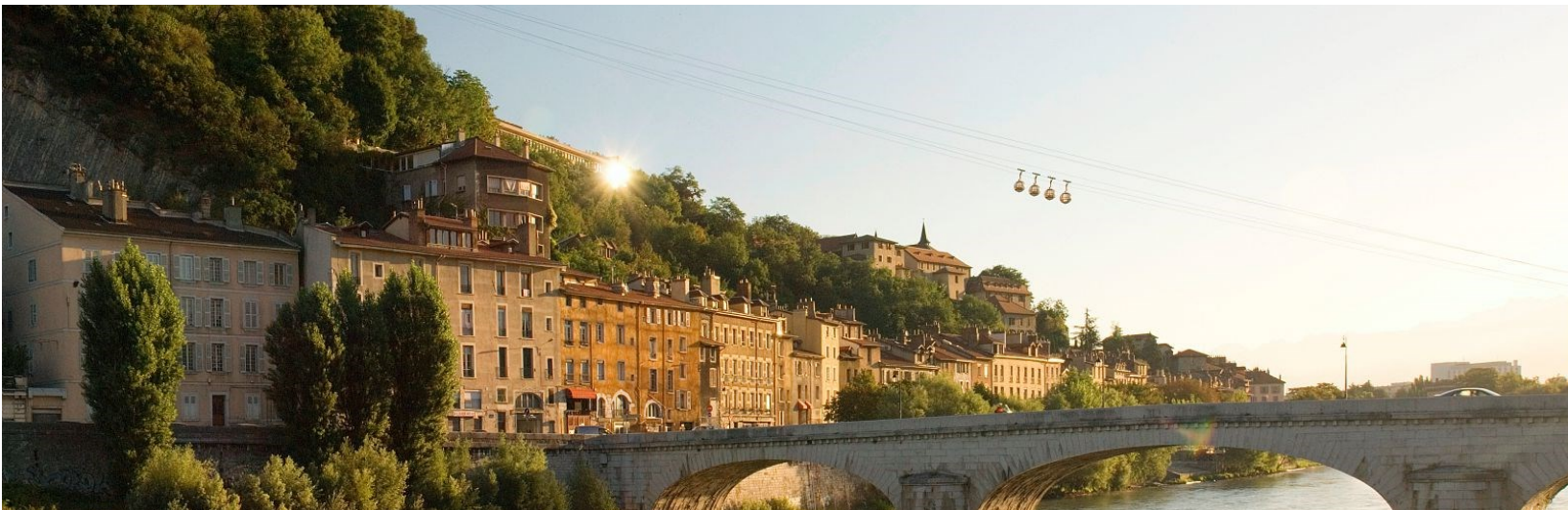
Grenoble - La Bastille