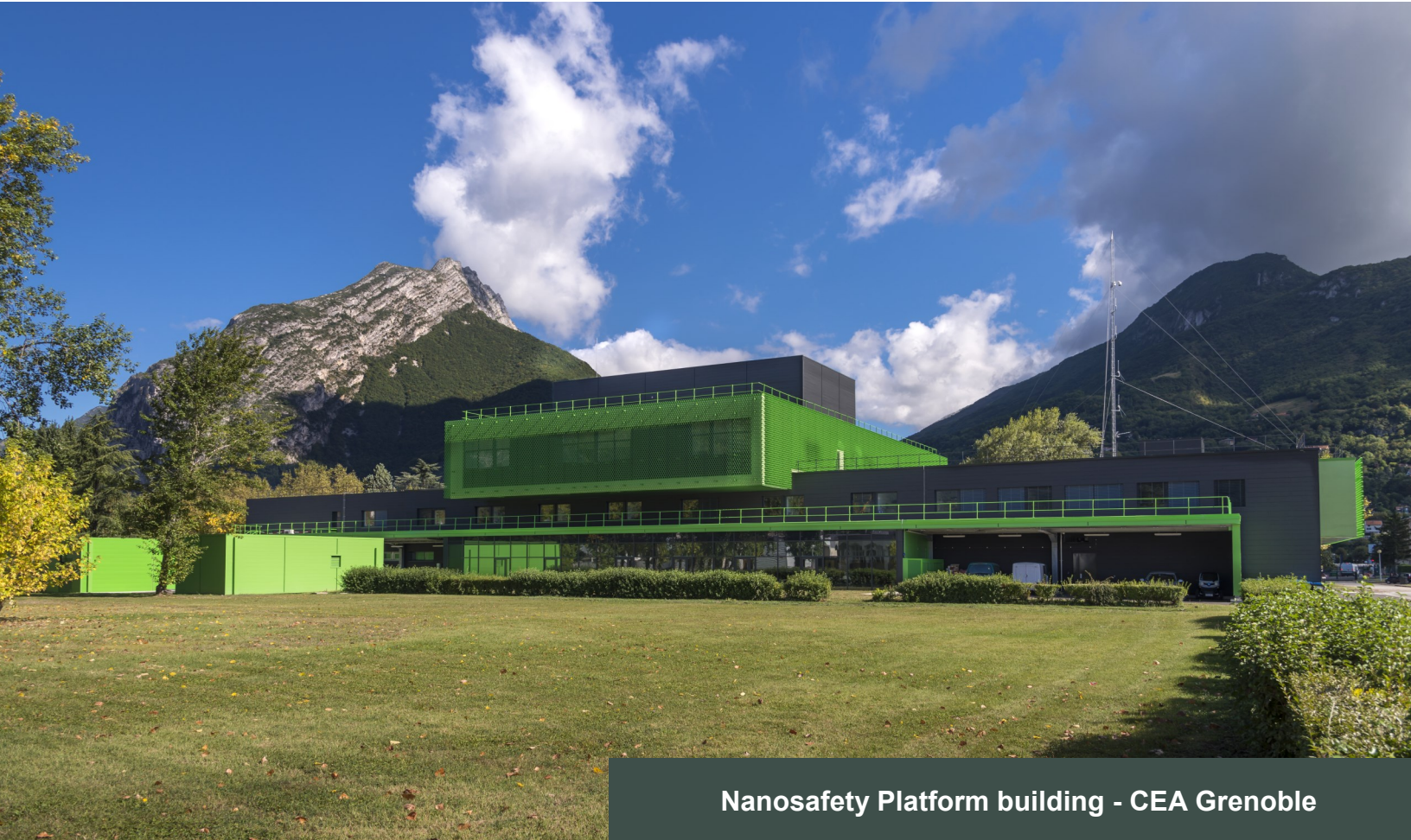
Nanosafety Platform building - CEA Grenoble